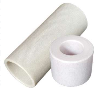
Electrical insulators and thermal insulation