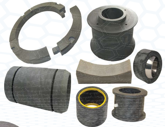
Custom machined components