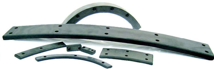
Wear pads: curved, segmented, countersunk or counterbore holes