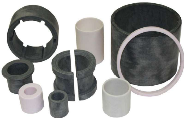
Plain bearings (bushings), flange bearings, split bearings, spherical bearings, water lubricated bearings